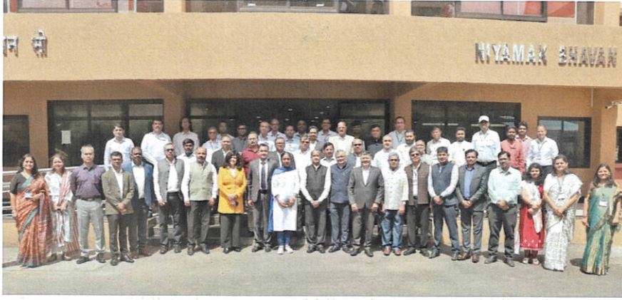
Chairperson, AERB [11 th from Left] with the participants of the Discussion Meet

This event provided AERB with insights into the challenges and concerns faced by these organisations that are new to the nuclear sector. It also paved the way for a continued engagement and future exchanges between industry and the regulatory body.