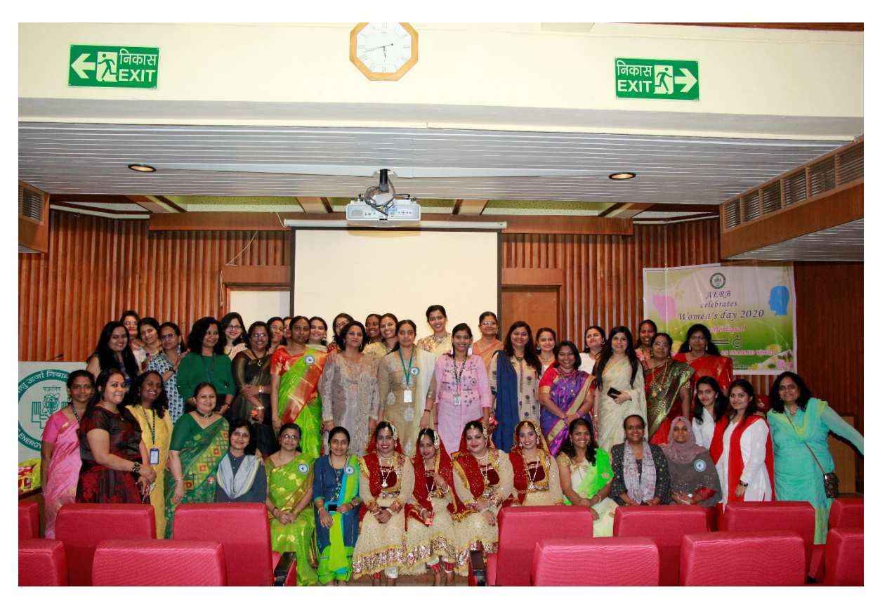
Gathering on Women's Day