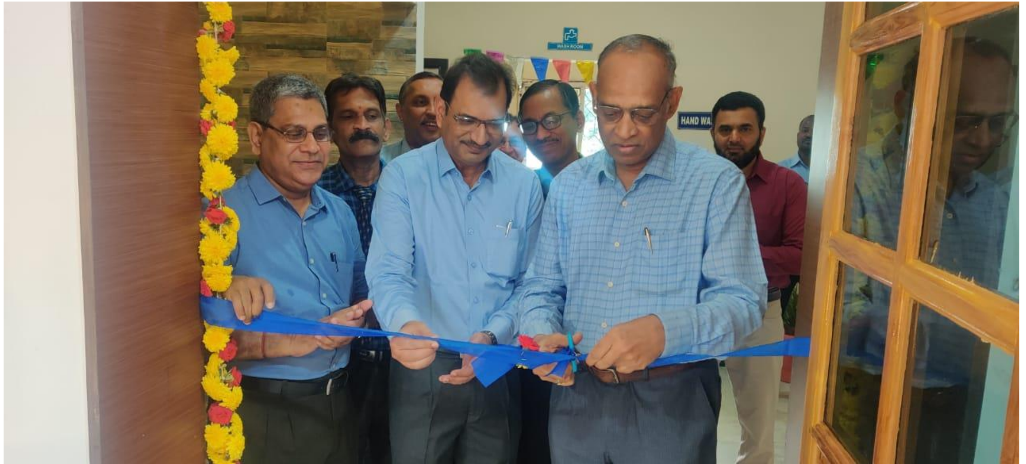
Chairman AERB Inaugurated VIP dining hall at SRI Guest house