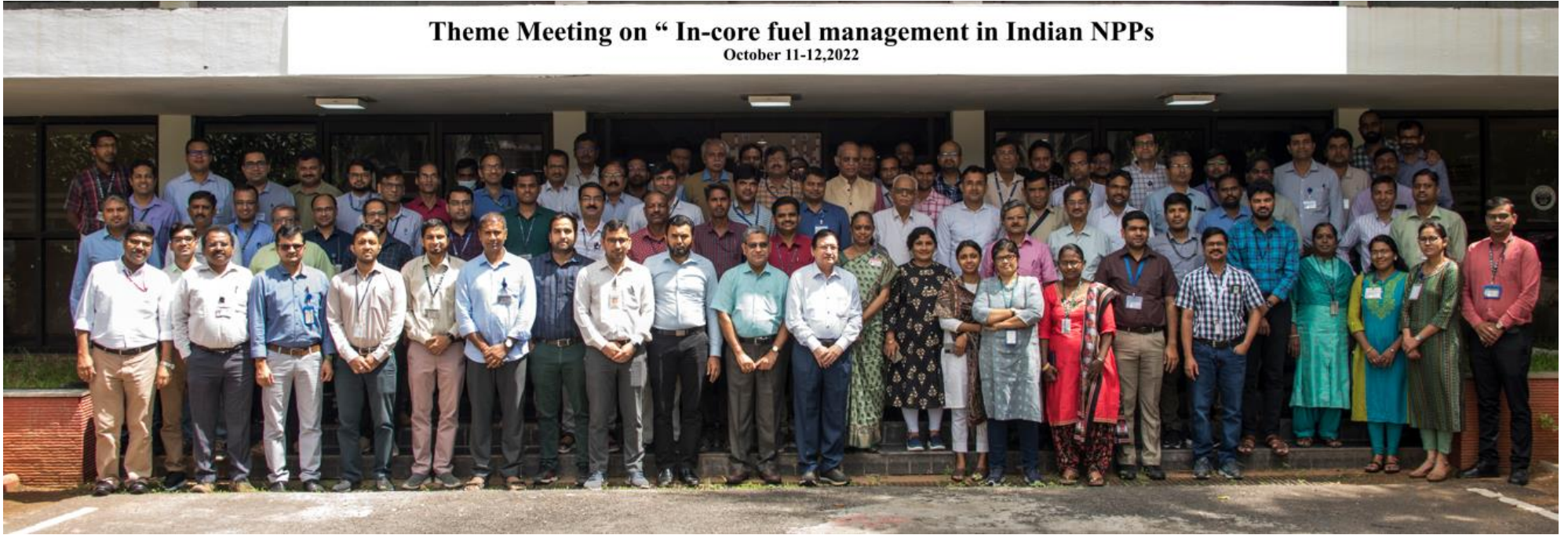
Theme meeting participants