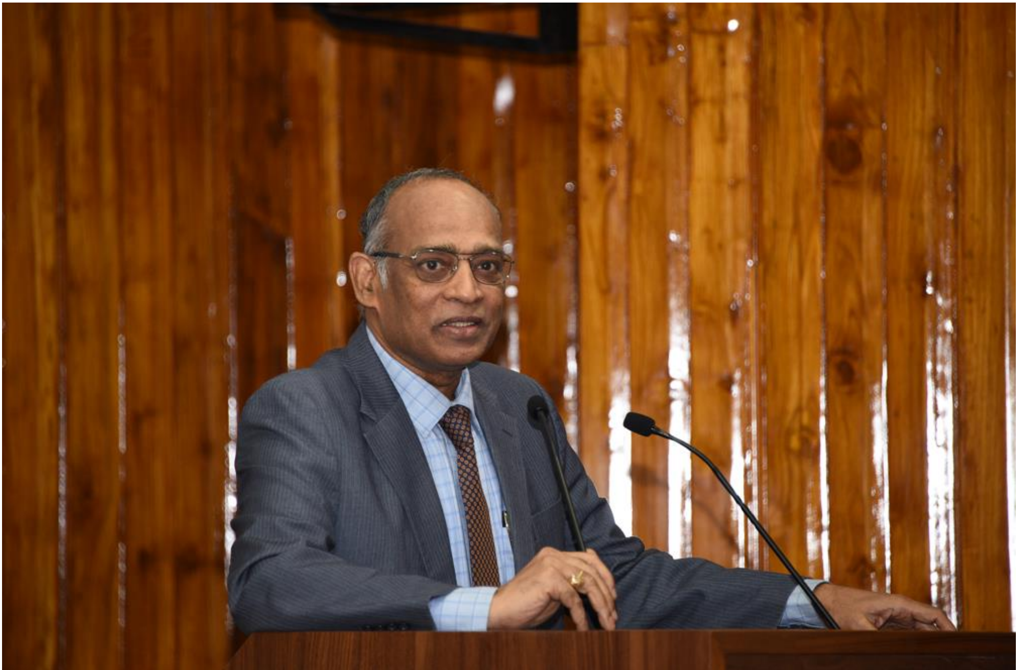
Chairman AERB delivering Inaugural address