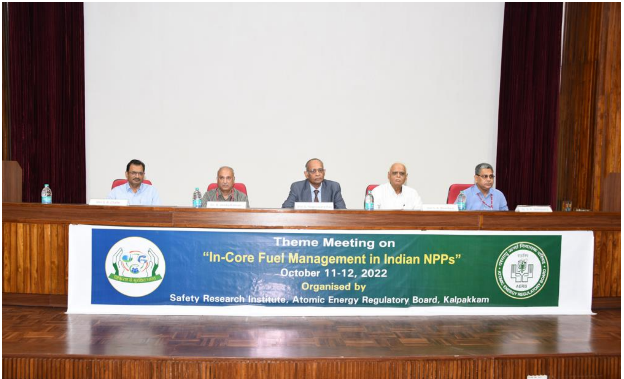
Inaugural function of theme meeting