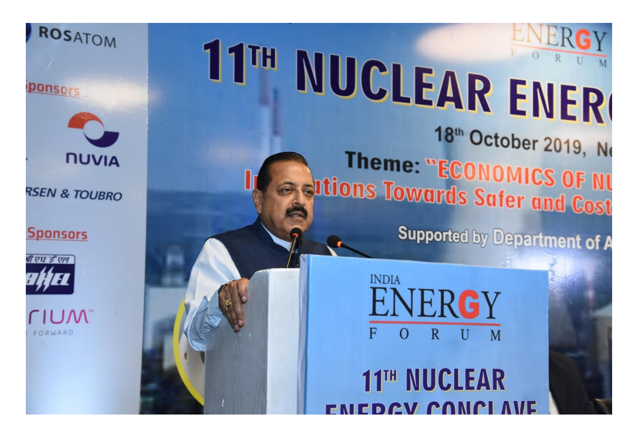
Dr. Jitendra Singh, MoS(I/C) for DoNER, MoS in Prime Minister's Office, DoPT, Dept. of Space and Atomic Energy addressing the Conclave

Chairman, AERB chaired the Session on "Use of nuclear energy in Healthcare and Municipal Waste Treatment". He briefed about the radiation applications for societal benefits in health care for therapy, diagnosis, Nuclear medicine, Industrial Applications and Research Applications. He explained numerous applications of radioisotopes in industrial applications such as radiation processing for food preservation, sterilization of medical products, municipal waste treatment, blood irradiation, industrial radiography for non-destructive examination (NDT), etc. During the session following three special presentations were made on radiation technologies and waste disposal. (1) Imaging using radioisotopes for Diagnostics; (2) Radioisotopes for Therapeutics and (3) Management of radioactive waste in health care and research sectors.