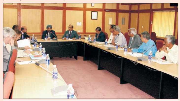
Senior Officials of AERB and French delegates at the AERB-ASN Workshop

There were presentations from Indian delegates covering safety review of Reactor Pressure Vessel of KKNPP, overview of JNPP and experiences during construction of PHWRs & VVERs. During the feedback session, certain new topics were identified by the participants, which may be covered in the future workshops.